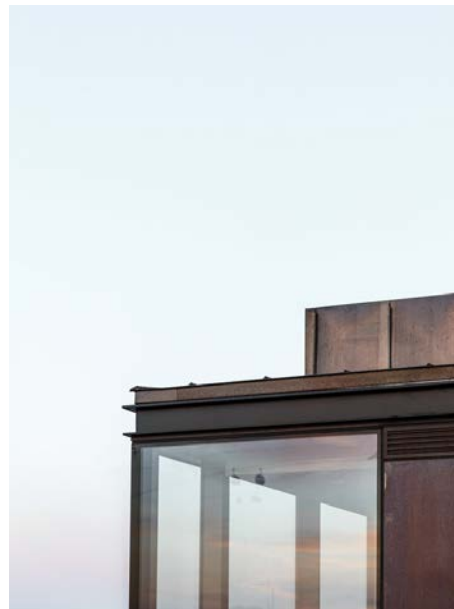
Waterman Gardens at Greenwich Peninsula