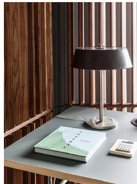
Room divider by Nathalie Schwer , lamp from Jacksons , desk by Please Wait To Be Seated