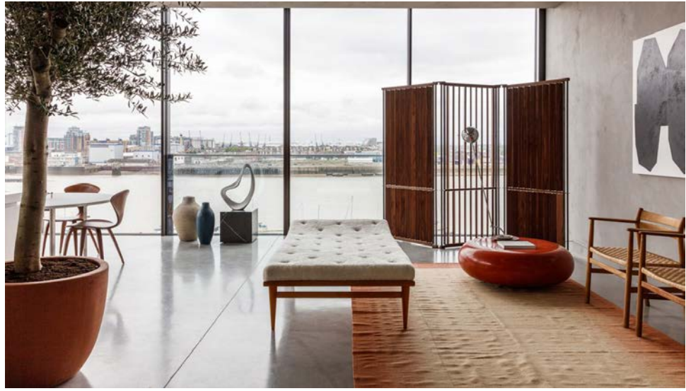
Living & dining room