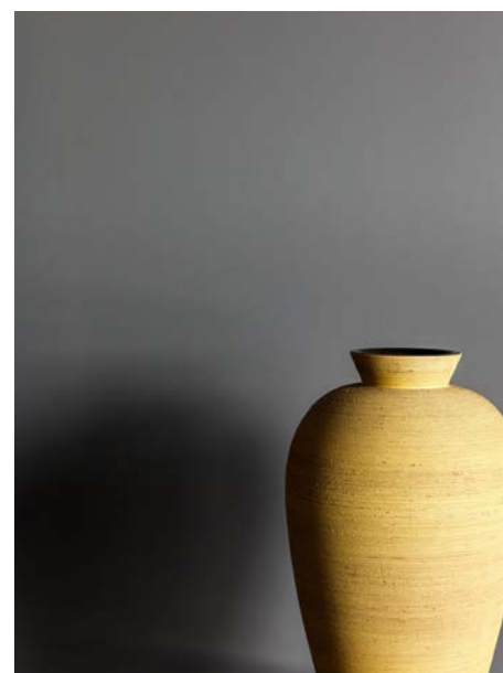
Vase from Jacksons