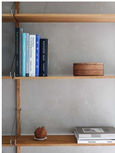
Bookshelf by Frama, books from Phaidon