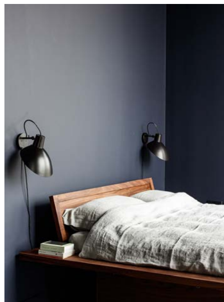
Bed frame by Nathalie Schwer , wall lamps by Astep