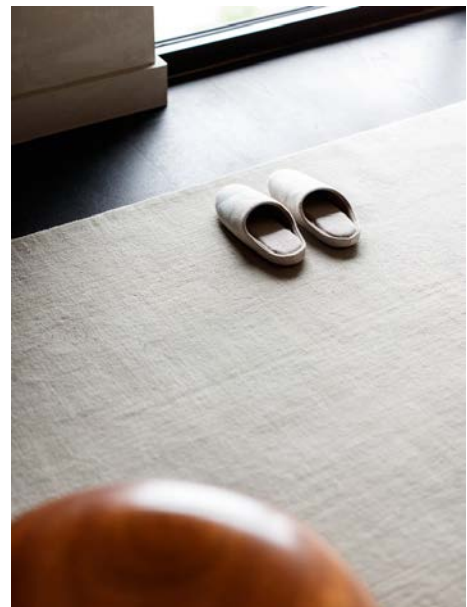
Moor rug by &Tradition