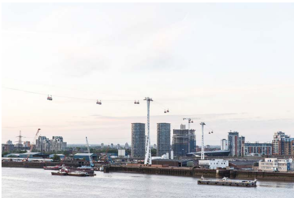
View from the penthouse