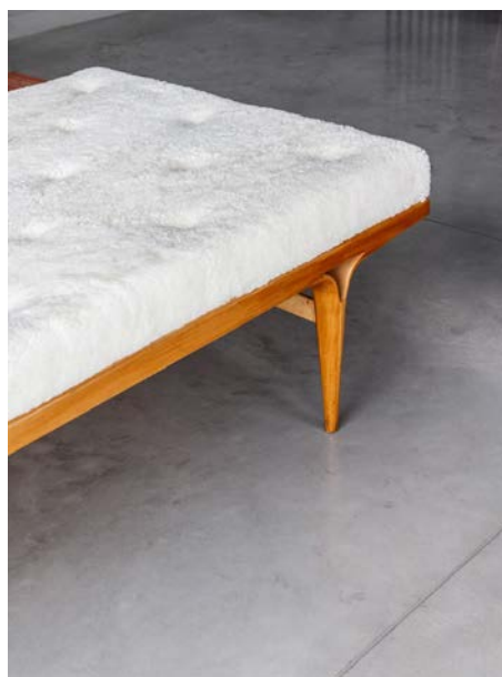
Bruno Mathsson daybed from Jacksons