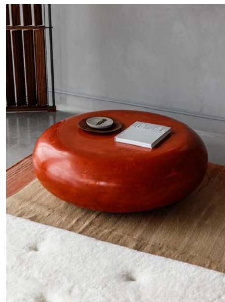
Coffee Bean table by McCollin Bryan