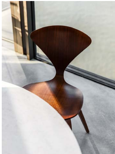
Cherner classic walnut chair from Conran, PK54 dining table from Fritz Hansen