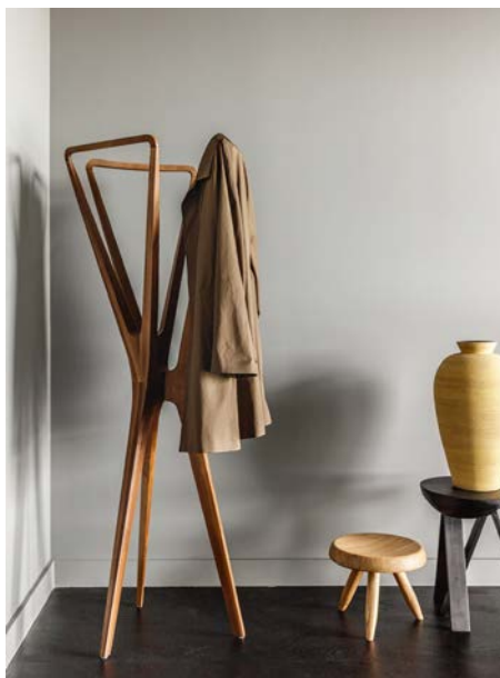
Coat rack & méribel stool from Conran , vase from Jacksons