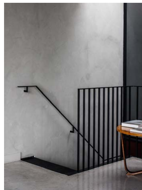
Table from Else Schneider