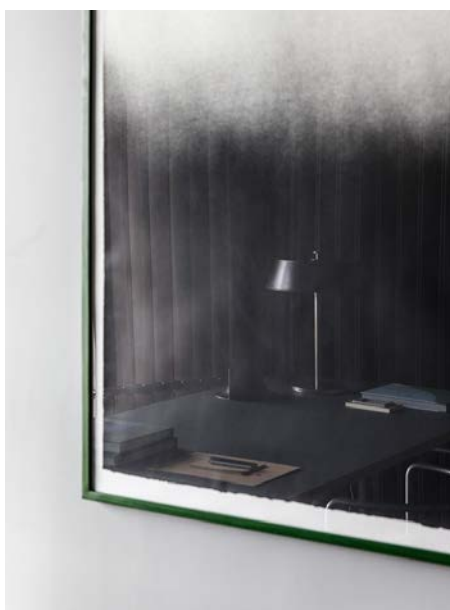
'Haze' print in forest green wooden frame