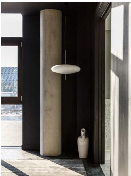
Pendant lamp by Astep , vase from Jacksons