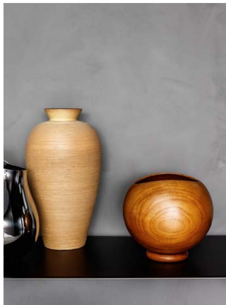
Vases from Jacksons